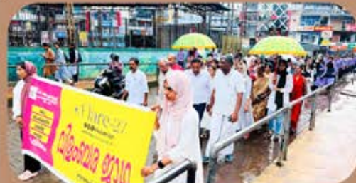
VILAMBARA JATHA PASSING THROUGH TALIPARAMBA TOWN