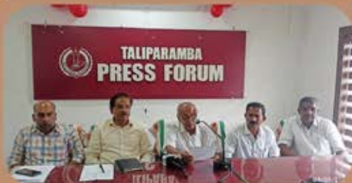
PRESS CONFERENCE HELD AT PRESS FORUM, TALIPARAMBA AS A PART OF FLARE 23- ARTS, CULTURAL, COMMERCIAL AND SCIENTIFIC EXHIBITION ORGANIZED BY SIR SYED INSTITUTE