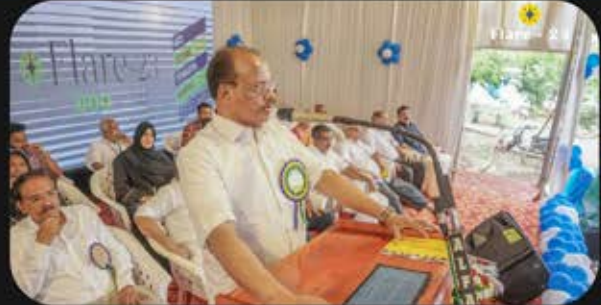
SRI. AHAMED DEVARKOVIL, HON. MINISTER OF PORT, MUSEUMS, ARCHAEOLOGY AND ARCHIVES INAUGURATING "FLARE 23" THE MEGA EXHIBITION OF SIR SYED INSTITUTE FOR TECHNICAL STUDIES, TALIPARAMBA