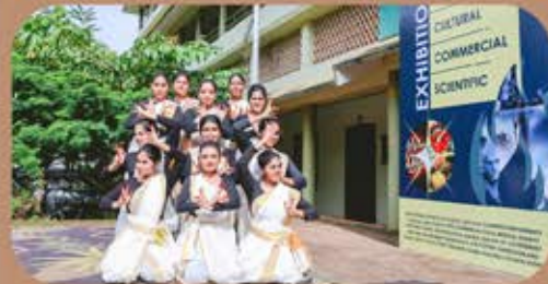
FUSION DANCE PERFORMED BY STUDENTS OF SIR SYED INSTITUTE AS A PART OF FLARE 23 PROMOTION