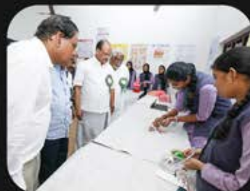
SRI. AHAMED DEVARKOVIL, HON. MINISTER OF PORT, MUSEUMS, ARCHAEOLOGY AND ARCHIVES VISITING THE EXHIBITS OF ARCHAEOLOGY DEPARTMENT, KERALA STATE