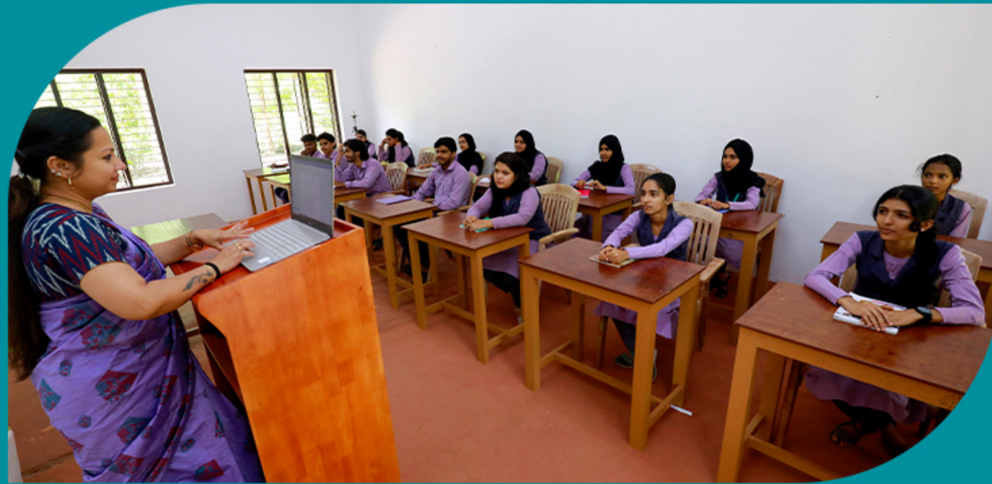
SMART CLASS ROOM