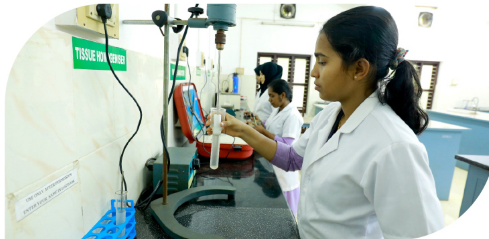
P.G. LAB. BIOCHEMISTRY