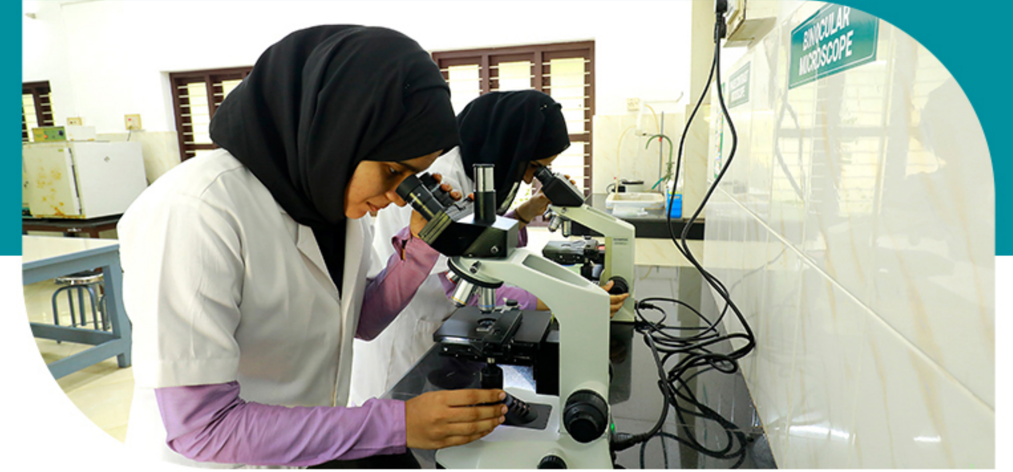
P.G. LAB. MICROBIOLOGY