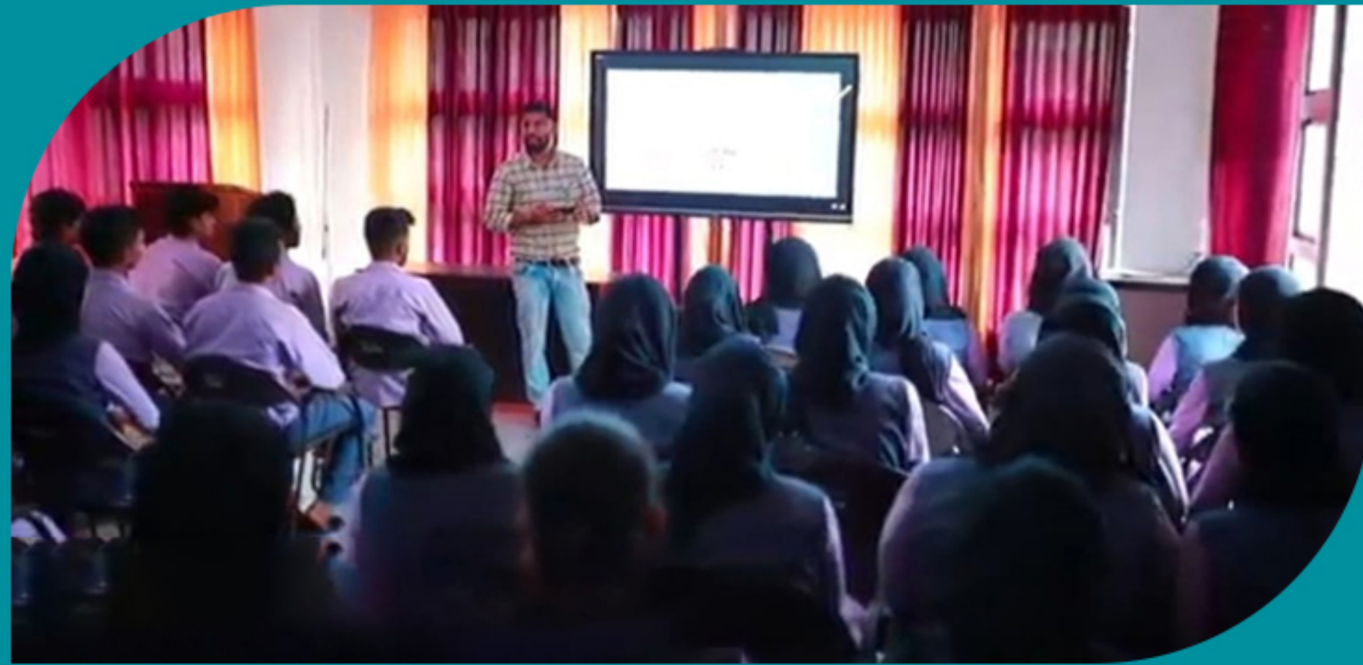
INTERACTIVE LECTURE HALLS