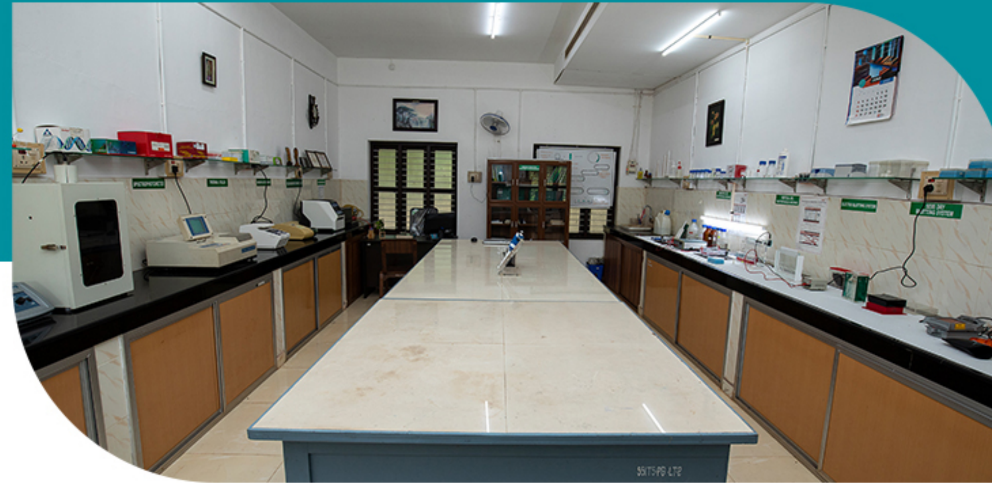
P.G. LAB. BIOTECHNOLOGY