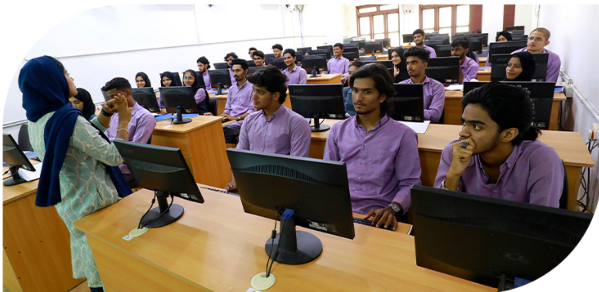
P.G. LAB. COMPUTER SCIENCE